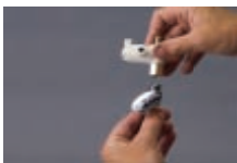
Attach Adapter Valve