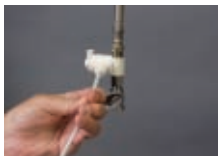
Insert PEX Line