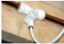
Insert PEX Line